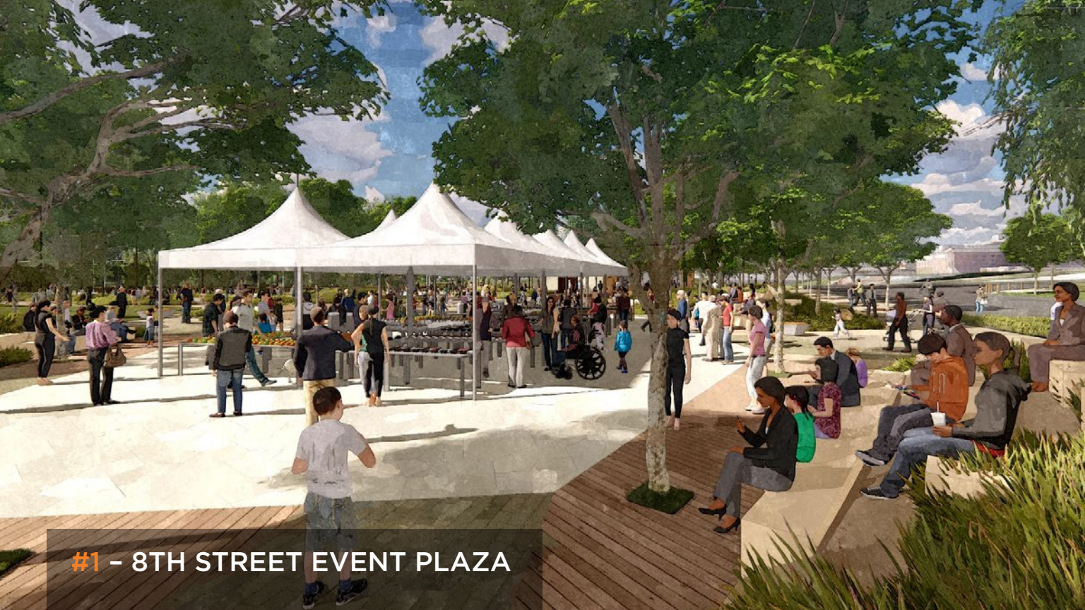
#1 - 8TH STREET EVENT PLAZA