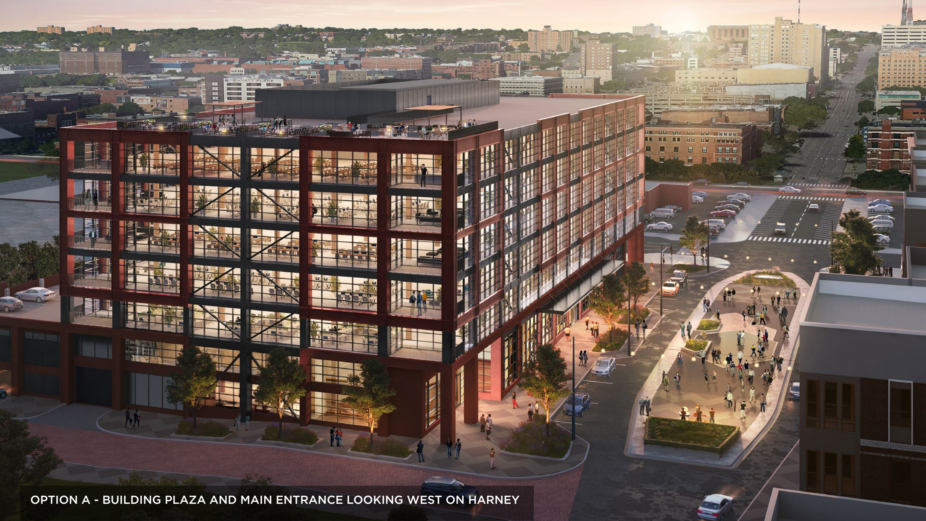
OPTION A - BUILDING PLAZA AND MAIN ENTRANCE LOOKING WEST ON HARNEY