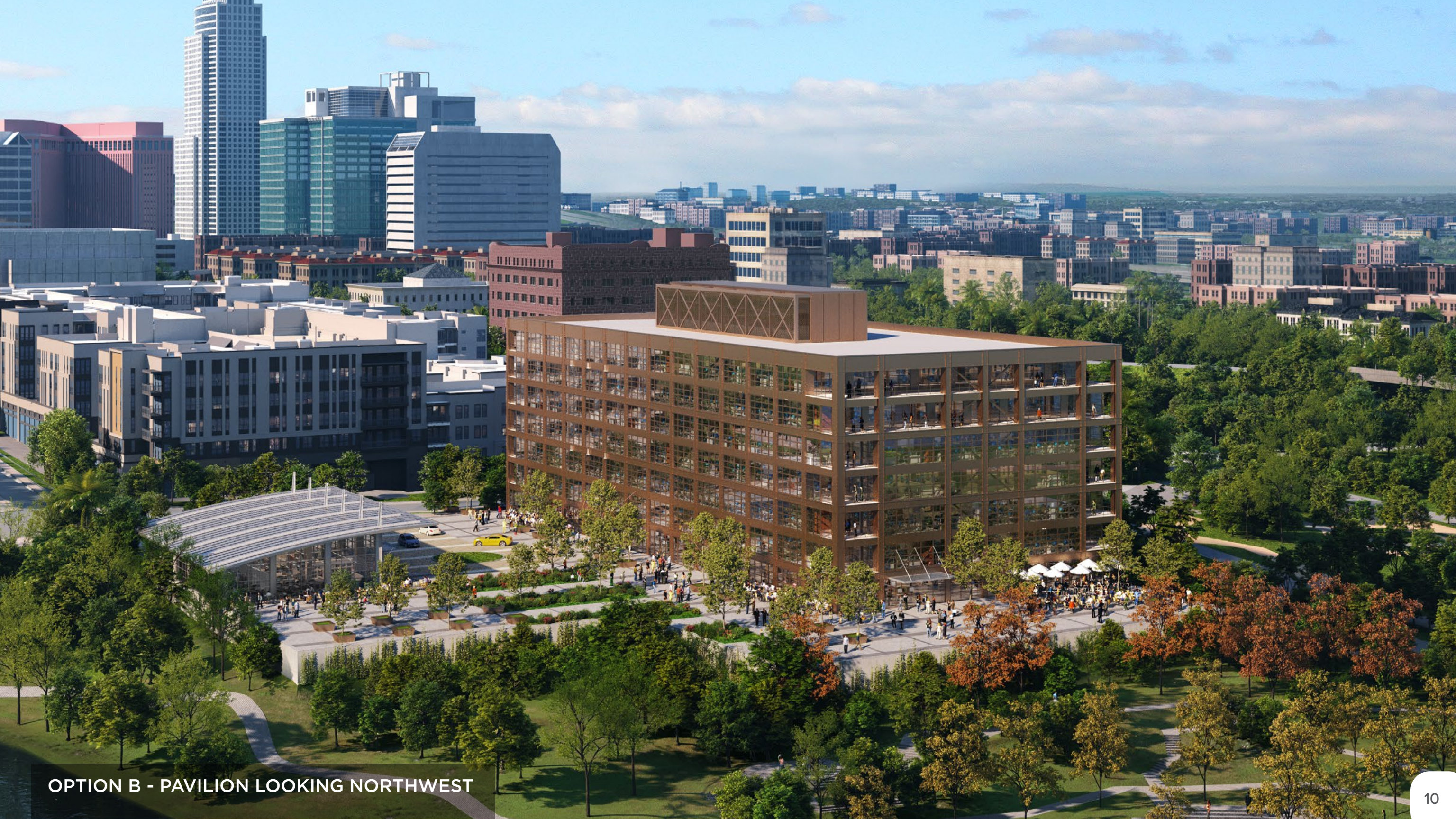
OPTION B - PAVILION LOOKING NORTHWEST