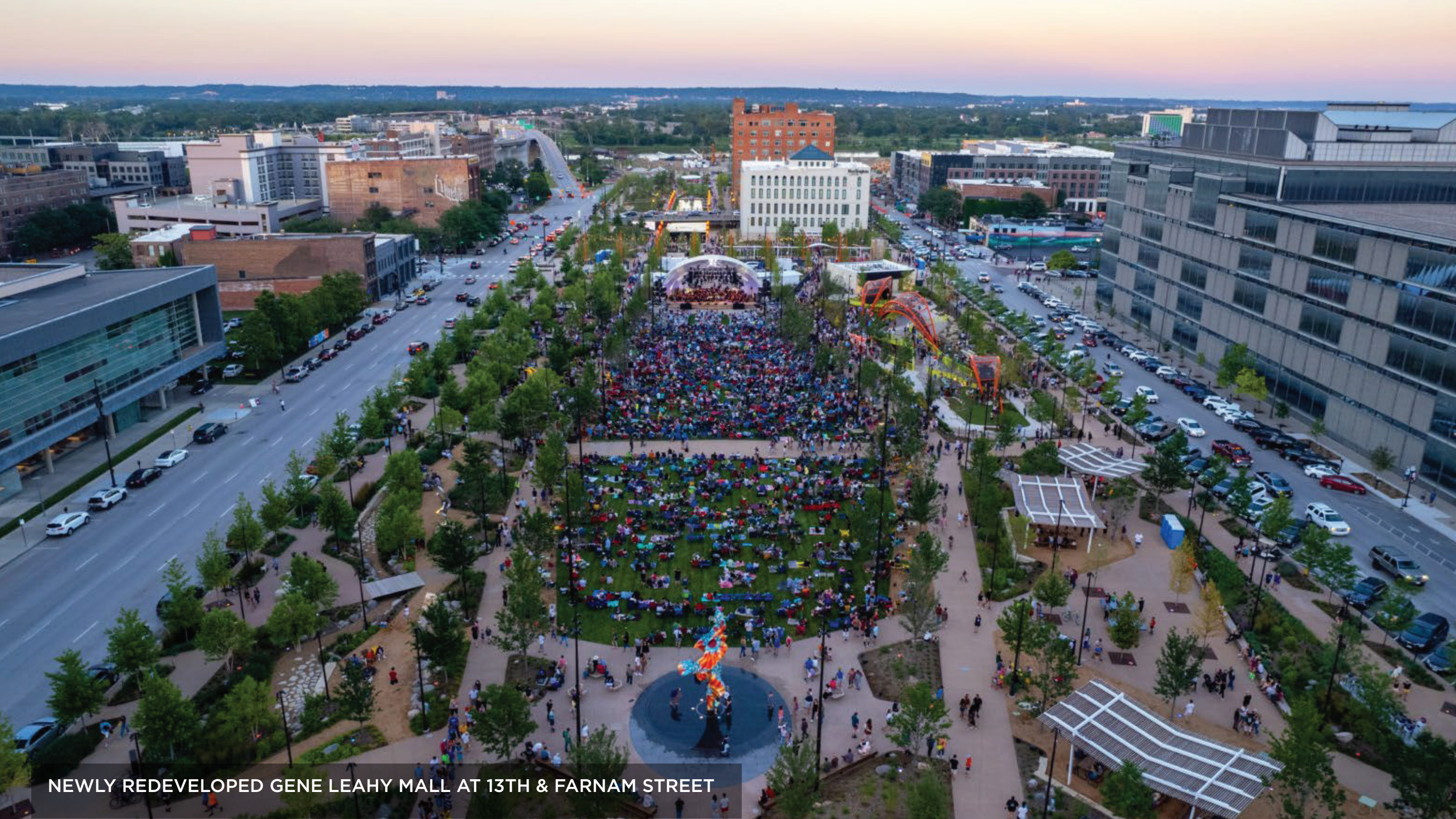
NEWLY REDEVELOPED GENE LEAHY MALL AT 13TH & FARNAM STREET