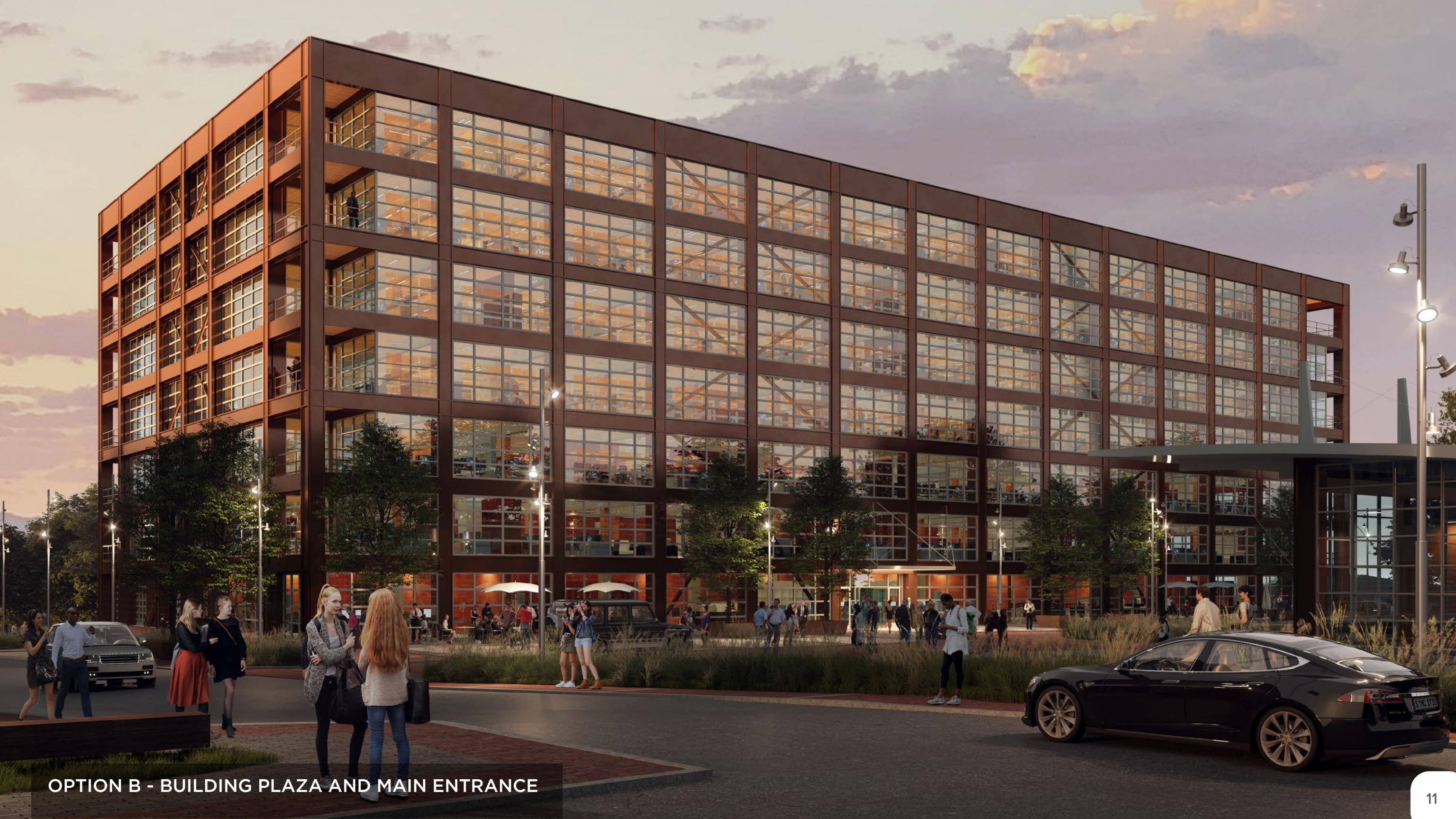
OPTION B - BUILDING PLAZA AND MAIN ENTRANCE