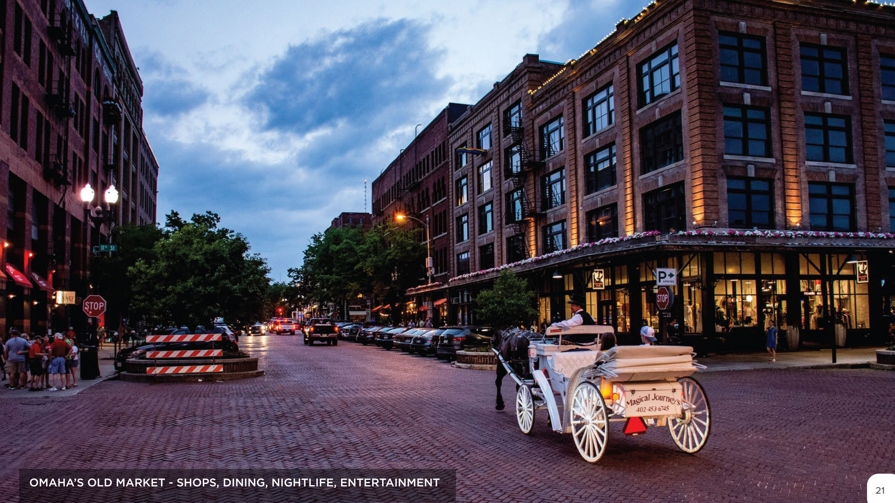
OMAHA'S OLD MARKET - SHOPS, DINING, NIGHTLIFE, ENTERTAINMENT