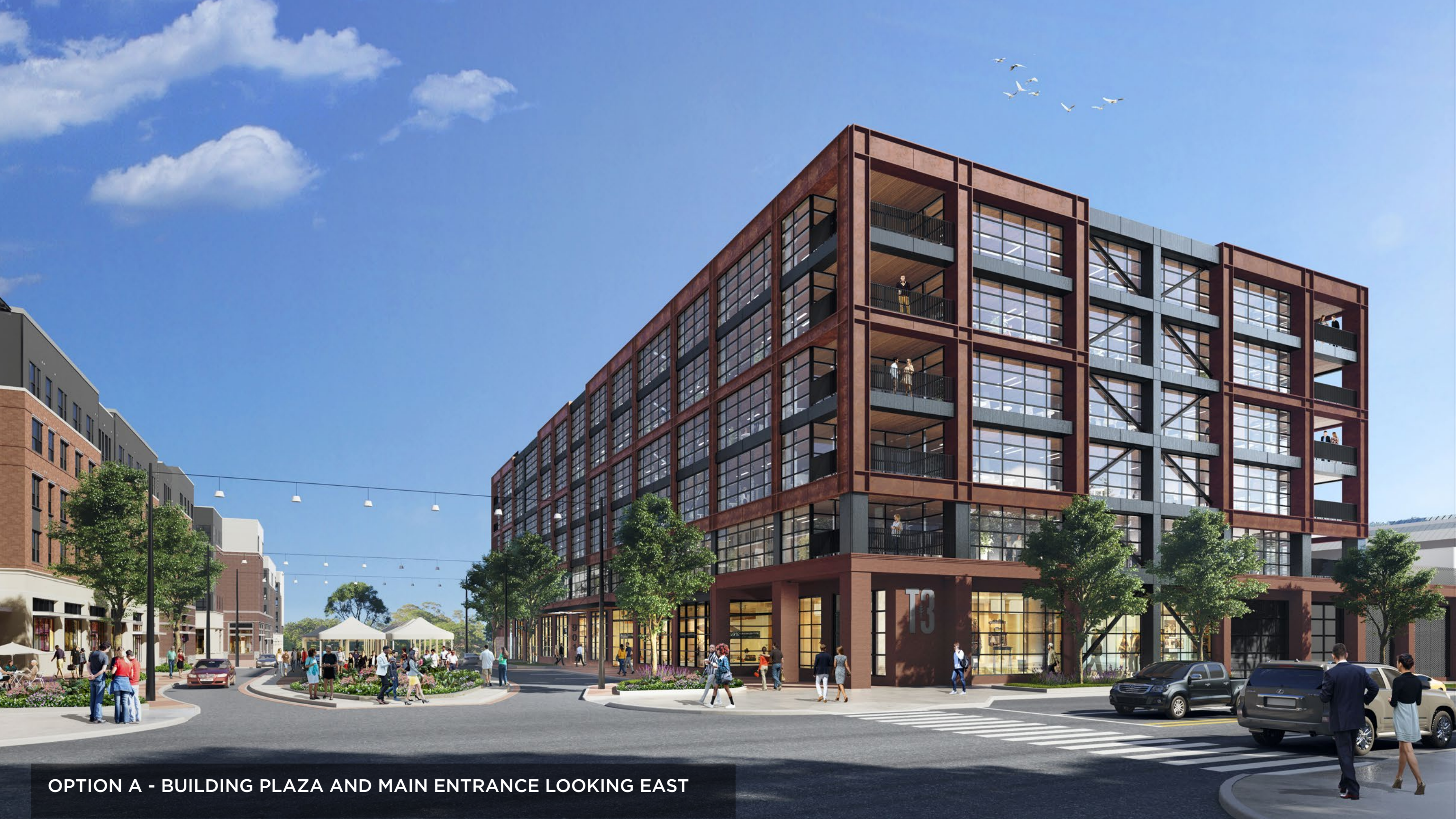
OPTION A - BUILDING PLAZA AND MAIN ENTRANCE LOOKING EAST