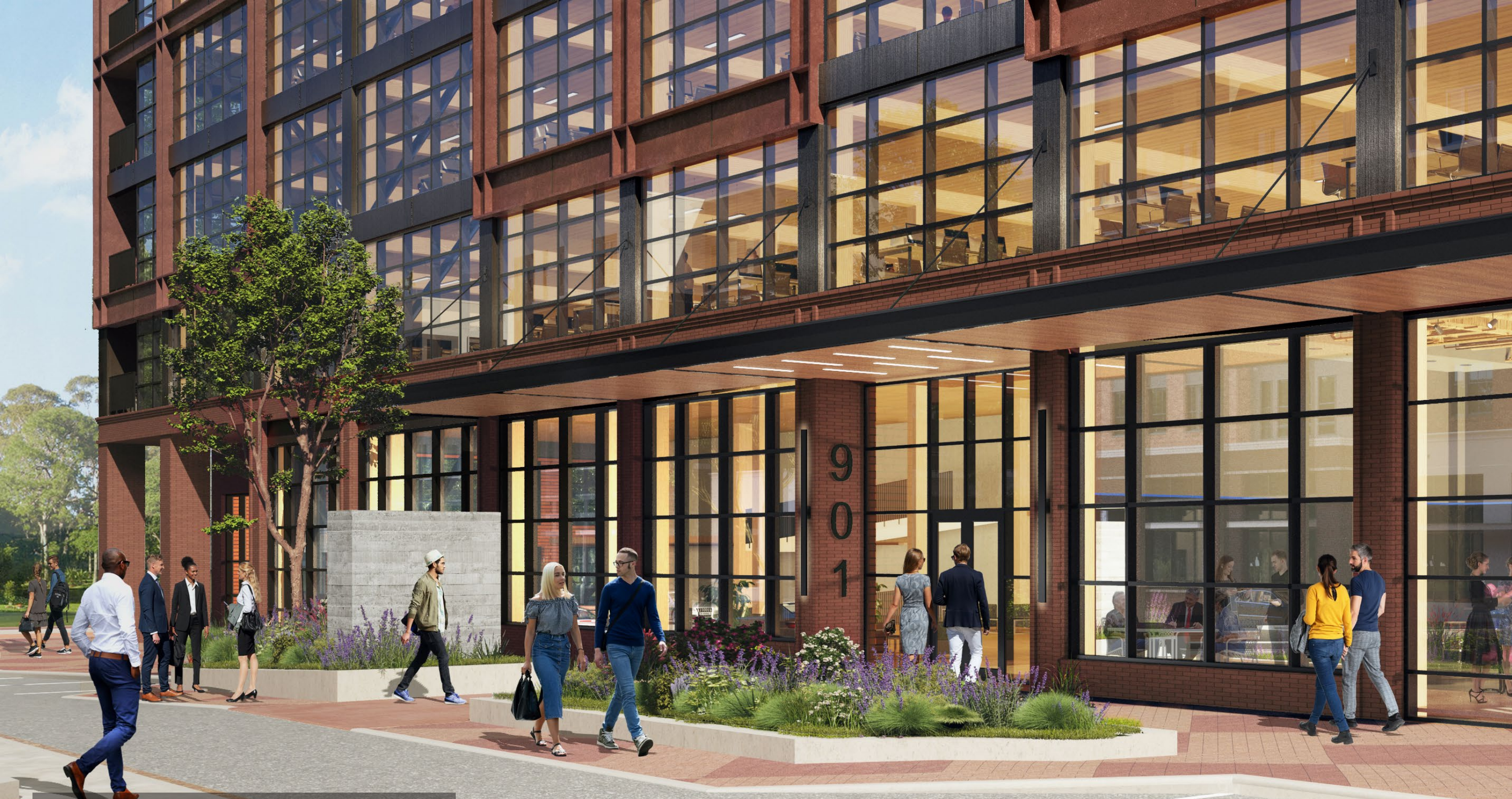
OPTION A - BUILDING MAIN ENTRANCE