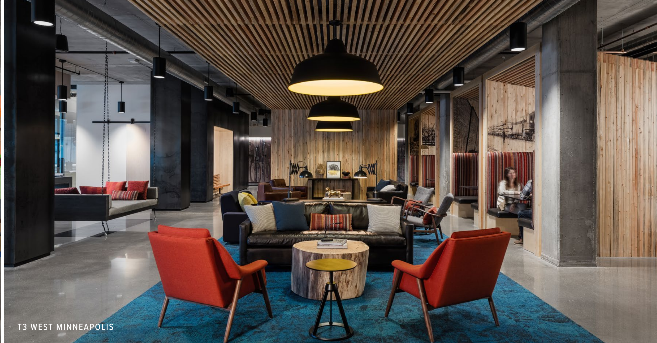
T3 WEST MINNEAPOLIS