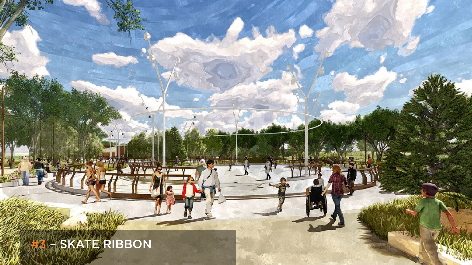
#3 - SKATE RIBBON