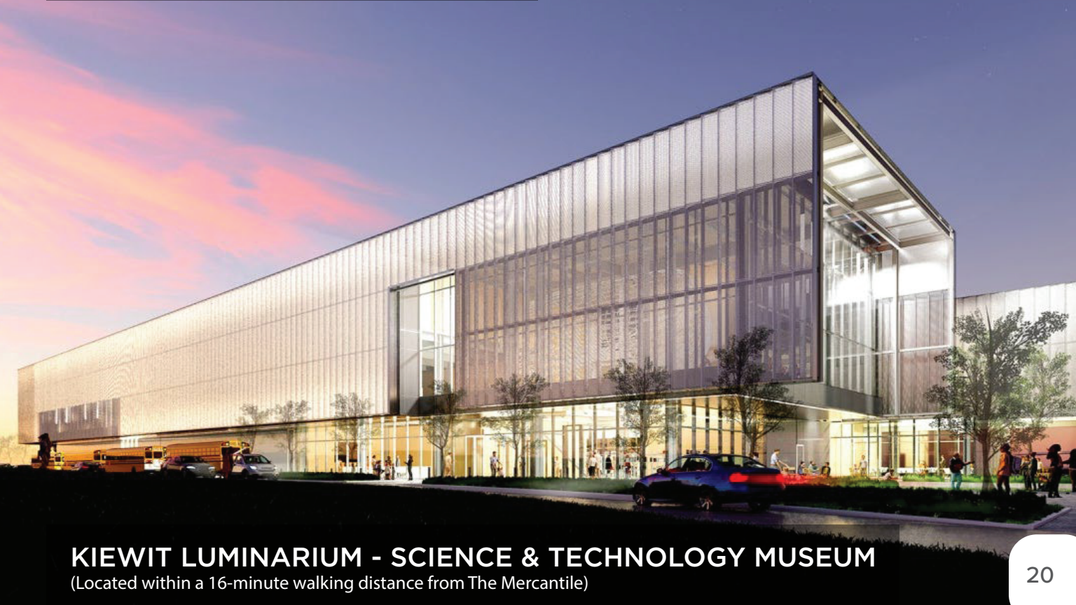
KIEWIT LUMINARIUM - SCIENCE & TECHNOLOGY MUSEUM (Located within a 16-minute walking distance from The Mercantile)