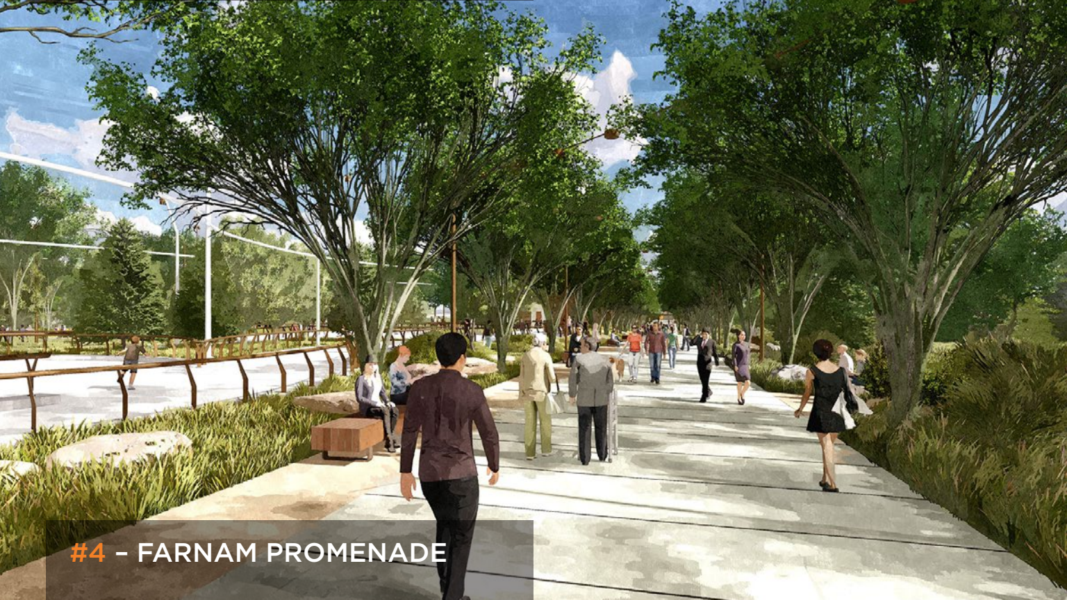
#4 - FARNAM PROMENADE