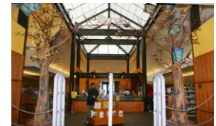
Washington Branch Library.

June 25 and 26, the ribbon cutting of the 50 th Street and Ames Avenue First National Bank facility on June 28, and the ribbon cutting of the SAC Federal Credit Union facility on 31 st Street and Ames Avenue scheduled for July 7. These events continue to speak to the positive economic momentum taking place in North Omaha.